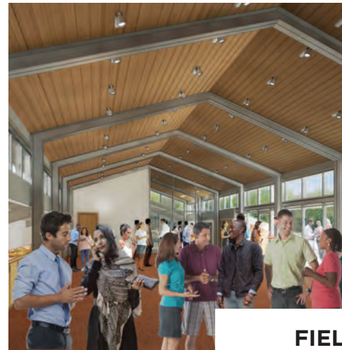
FIELD HOUSE WITH LOCKER ROOMS AND FUNCTION ROOM